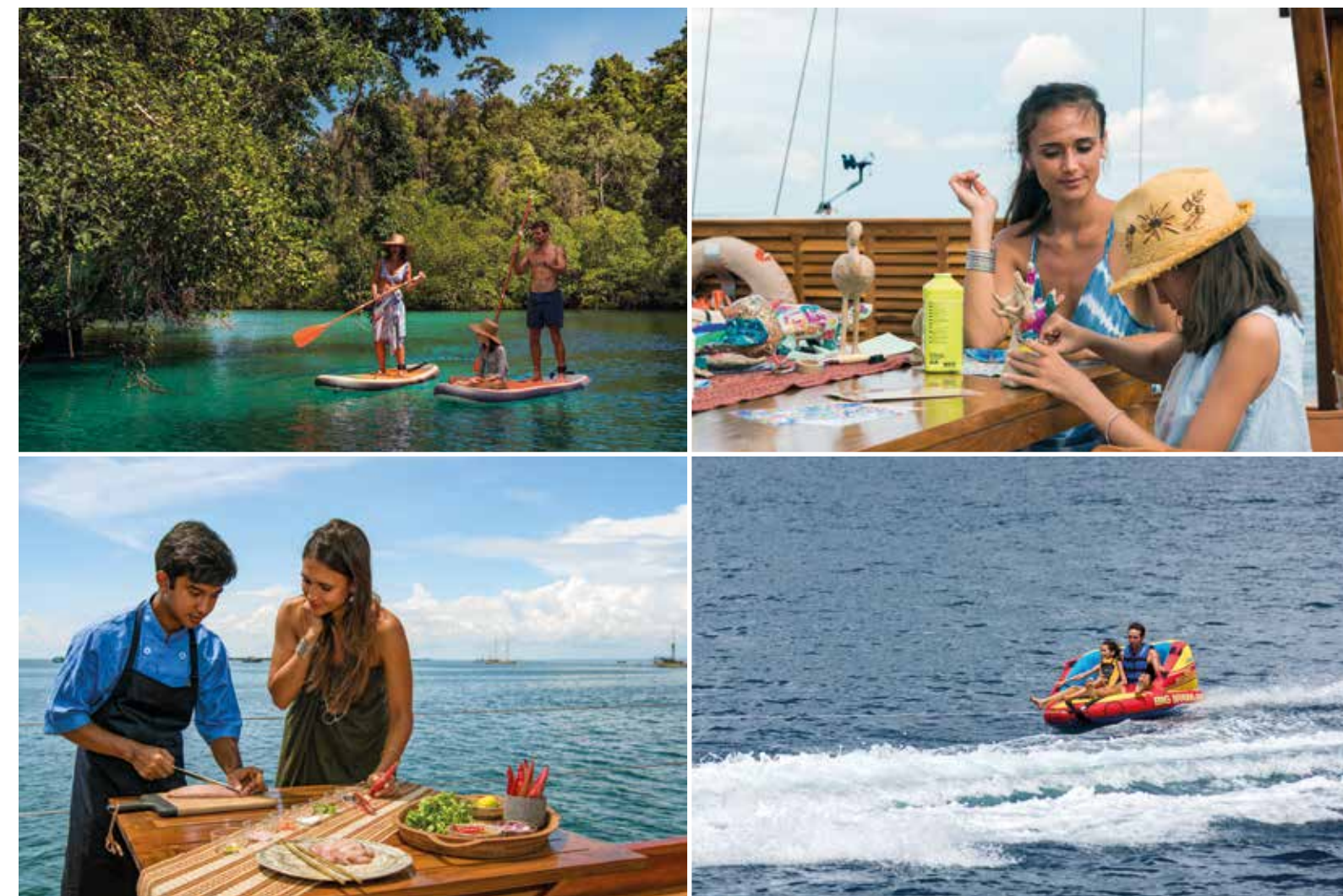
Sequoia offers plenty of activities on and around the yacht, including cooking classes, children's activities, paddleboarding, water-skiing and tube riding

Sequoia 's experienced Indonesian crew include several who have been with the yacht all her life. Depending on the guests' desired activities and itinerary, the roster can include a cruise manager, butler, master therapist for spa treatments and a dive master.