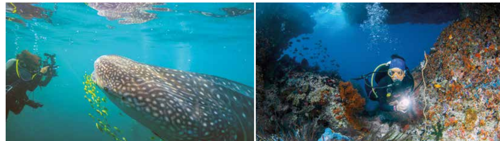
The Coral Triangle offers the world's most colourful and diverse marine life, with whale sharks a common sight

"We're focused on a very specific market that places high value on comfort, luxury and unique experiences. For small families, we've created an intimate setting that can't be found even in the top-end resorts or other yachts. Also, Sequoia moves every day, creating entirely different landscapes, seascapes and experiences for guests."