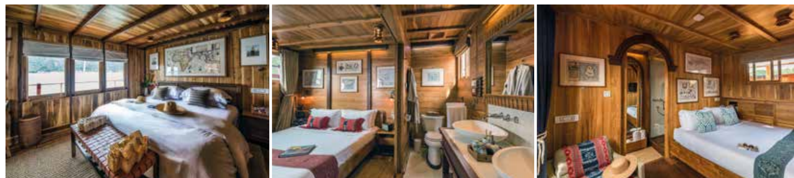
Sequoia offers luxury accommodation in the Sky Suite (left) on the top deck, and Island Suite (middle) and Ocean Suite (right) on the main deck

"I was fortunate to be able work with some of the world's most innovative doctors and I learned to work towards understanding future demand," he says. "In the case of our business, it may be that families are bored of going to luxury hotels and staring at their computer or phone. They now appear to be favouring more adventurous and active experiences that connect them to nature and each other."