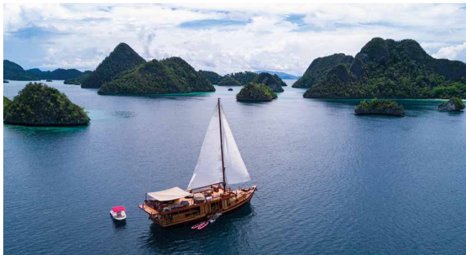
Sequoia has added a master cabin and a library on the top deck since the above photo was taken; she charts in Komodo in the summer before heading east for winter

Fresh from a refit ahead of her fifth birthday in September, the 26m Sequoia is enjoying a second wind as one of Indonesia's leading luxury charter yachts, having had a two-year lull due to the pandemic.