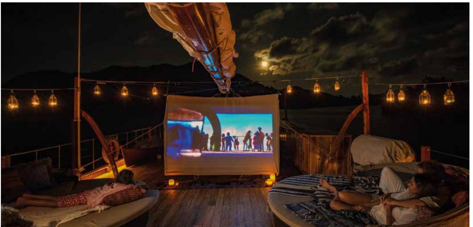
Enjoying a movie under the stars is one of Sequoia ’s signature attractions and can provide an ideal end to a full day of activities