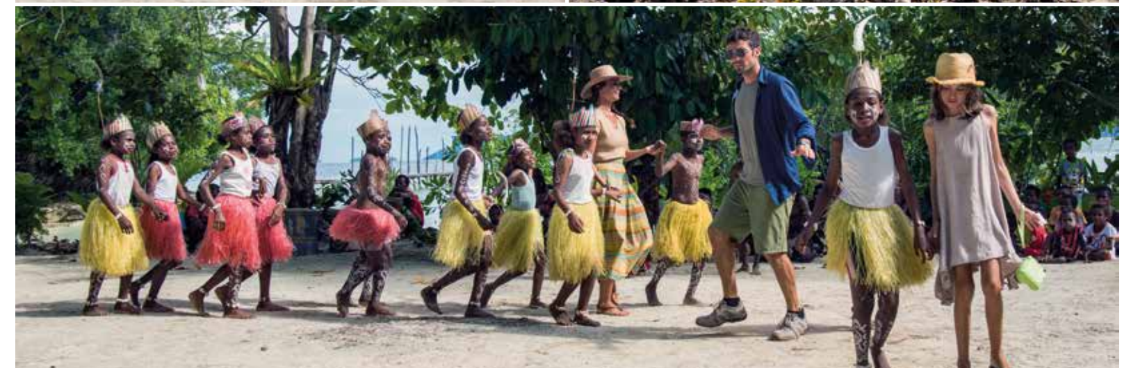
As well as beach time, land activities can include walks through rainforests and up mountains, as well as cultural visits to local villages