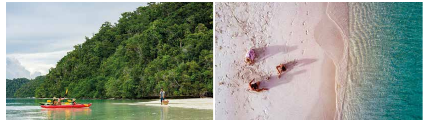
Kayaking is a nice way to explore coastlines and reach beaches offering pure white sand and clear waters