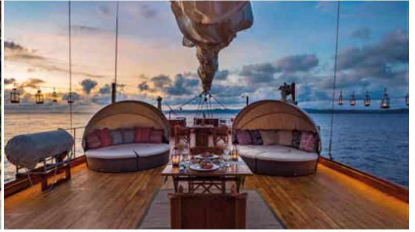
Dining can be arranged informally or formally on a beach or on the yacht, where the sky deck provides a spectacular venue in the evening