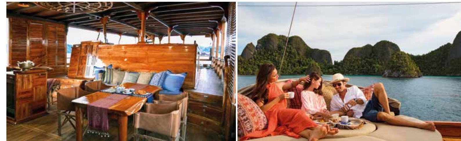
The Great Room (left) on the main deck is typically used for breakfast; the sky deck (right) is a favourite hangout during the day

Designed for eco-conscious cruising, the hardwood yacht was hand-crafted by the Konjo boatbuilders over four years, yet with an American emphasis on safety and sustainability.